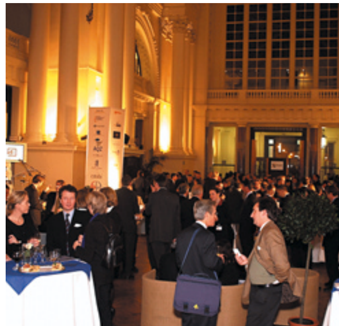
Brussels - Euronext - November 2001 JEE & EFS Awards Ceremony and Networking Event 400 participants