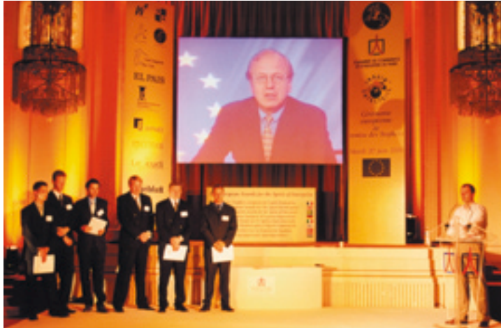
Paris - Chamber of Commerce and Industry - June 2000 European Awards for the Spirit of Enterprise Award Ceremony - 300 participants